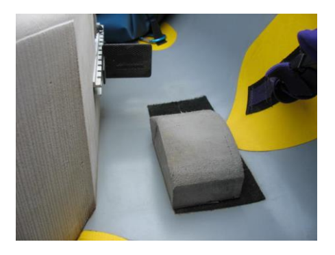
Center Ankle Block on the Velcro for the initial positioning